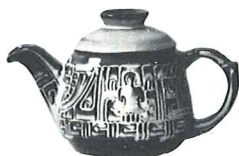
7J—2 CUP TEAPOT 6.50