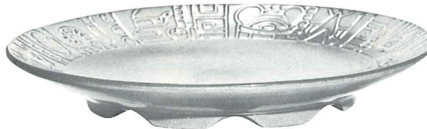
7FC—15" CHOP PLATE 25.00