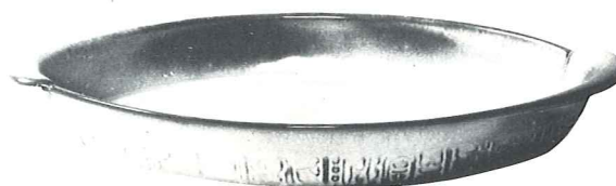
7Q—13" DEEP PLATTER 7.75