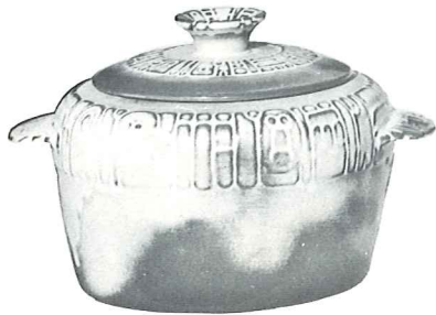
7W—3 QT. BAKER/BEAN POT 13.25 7W/W—BAKER & WARMER, SET 20.50