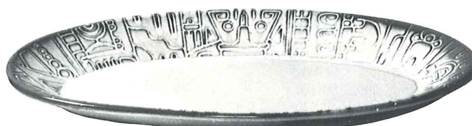
7TP—17" AZTEC OVAL PLATTER 17.50