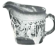
7A—6 OZ. CREAMER 3.25