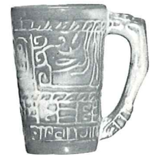
7M—14 OZ. MUG 4.50