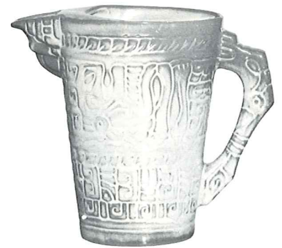
7D—2 QT. PITCHER 9.25