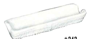
*242 CORN DISH 2.50