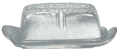
7K—BUTTER DISH 6.50