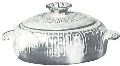
7V—2 QT. BAKER/BEAN POT 9.25 7V/W—BAKER & WARMER, SET 16.50