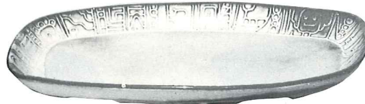
7QS—13" STEAK PLATTER (SHALLOW PLATTER) 5.00