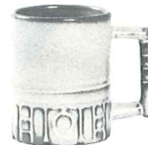
*C4—12 OZ. COFFEE MUG 3.25